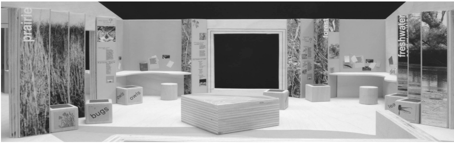
This is a model of the new educational displays in the Visitor's Center

As always there will be a country store featuring homemade baked goods, homegrown produce, and similar goodies. Lunch will be available to purchase, and will feature homemade