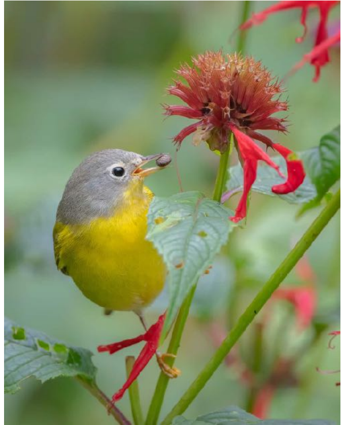
The Plants for Birds Award Winner is a Nashville Warbler photographed by amateur Shirley Donald in Blue Sea, Quebec, Canada

This year's exquisite photographs celebrate the splendor of many bird species protected under the 100-year-old Migratory Bird Treaty Act (MBTA), the most important bird conservation law, which is currently under siege in Congress and by the Department of the Interior.