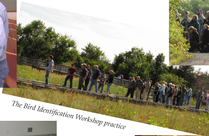
The Bird Identification Workshop practice