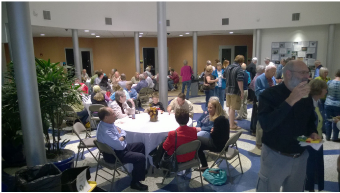
The reception in the rotunda of the Cargill Learning Center at the Sedgwick County Zoo.