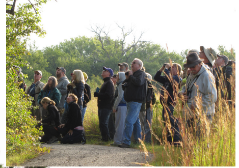
A Black-throated Green Warbler had everyone excited on the morning field trip.