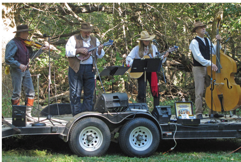
The Tallgrass String Band performing at the 40th Anniversary Celebration