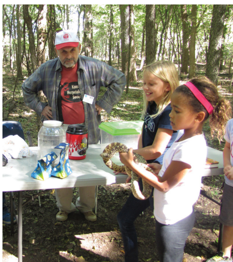
Bravely holding a snake

Sponsors: A. A. S. Oil Company, Arkansas City Convention and Visitors Bureau, Community National Bank and Trust, Corner Bank, Ionic Salon, Rindt-Erdman Funeral Home, RCB Bank, Stock Exchange Bank, The Trust Company of Kansas, Union State Bank