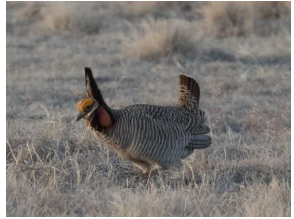
Lesser Prairie Chicken