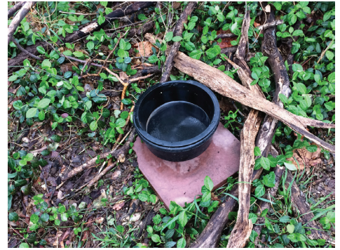
Feral cat feeding station

While clearing invasive bush honeysuckle from Oak Park on March 25, members of Wichita Audubon uncovered a feral cat shelter and feeding station within the park. The feeding station was fairly obvious, consisting of patio blocks upon which a bowl was placed. However, the shelter was well camouflaged within the dense honeysuckle. It consisted of two Rubbermaid totes connected together with a tube to form two chambers which were insulated with Styrofoam. The whole thing was covered with camo netting to conceal it from the general public and from the city, which has not authorized this activity. The shelter was removed and taken away by a city employee.