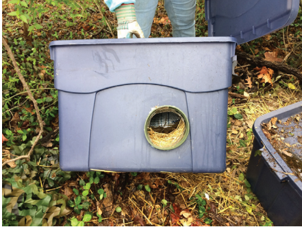
Feral cat shelter

As an owner of three indoor cats (if one can say they truly own cats), the plight of feral cats is concerning. However, as an avid birder I am also aware of the plight of birds and other native wildlife. In a recent, well-documented study it was shown that domestic cats kill between 1.4 and 3.7 billion birds and 6.9 to 20.7 billion mammals annually, with feral (unowned) cats causing the majority of this mortality. Another study shows that 96% of the visits to feeding stations were by other wildlife, such as skunks and raccoons. Competition among wildlife and among feral cats promotes the spread of disease and parasites. Further, additional studies have shown that efforts to reduce feral cat populations through trap, neuter and release (TNR) are largely ineffective. Feral cats, including those neutered via TNR, do not receive proper vaccinations or veterinary care.