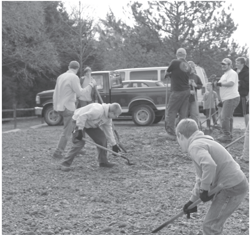
Volunteers spread gravel in the CNC parking lot