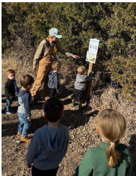
Lil' Tots had programs for four Mondays in January and February, with more than thirty preschoolers plus their parents attending. Each program featured a hike, a story and a craft.

Eden has CNC hopping with activities this winter, including Lil' Tots on the Trails, Eagle Watch, and Chickadee House Building.