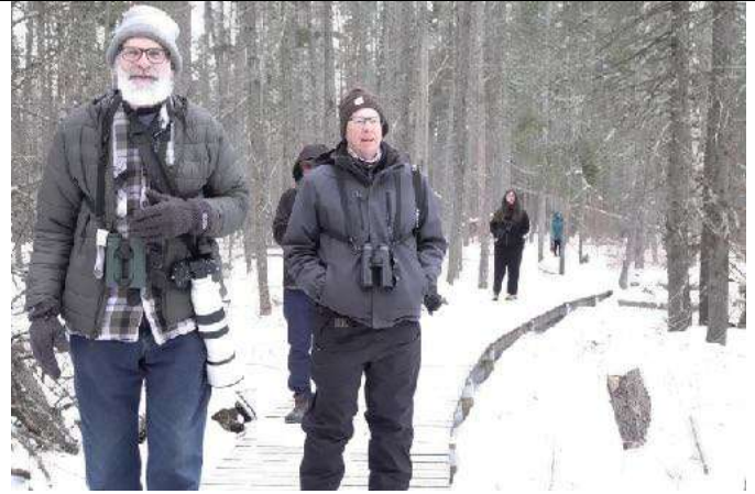
We returned to this boardwalk many times because of reports of a Black-backed Woodpecker. Others found it, but we never did.