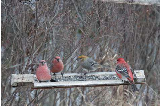
Friends of the Zax-Zim Bog maintain feeder stations throughout the area that host birds like these Pine Grosbeaks. Their dedication to keeping these stations filled is amazing.