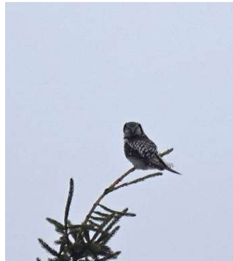
The Northern Hawk Owl was not close, but he did sit still and pose for us.