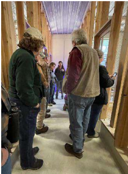
Touring the Masked Bobwhite breeding building