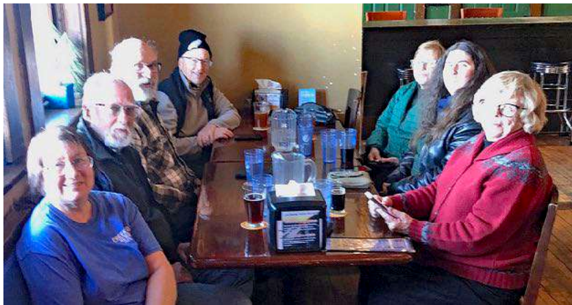
Our group at lunch in Superior, WI, after finding the Snowy Owl

Seven people braved the frigid temps and traveled to Minnesota for our extended field trip in January. It was snow covered, but the temperatures were actually quite mild – getting up into the 30's! Unfortunately that meant the owls we wanted to see were quite content to stay deep in the woods and out of sight. We did see Long-eared Owls at the Minneapolis airport, a Snowy Owl at the Duluth airport, and a Northern Hawk Owl at Zax-Zim bog. We also found other birds that we don't see in Kansas like Boreal Chickadee, Canada Jay, Evening Grosbeak, Redpoll, Spruce Grouse, and Pine Grosbeak. We had fun, saw some cool birds, and didn't freeze!