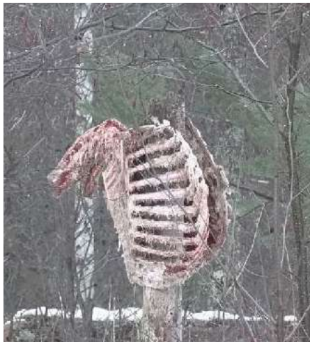
Every feeding station includes a deer carcass to provide fat and protein. How they keep scavengers from tearing them apart is unknown.