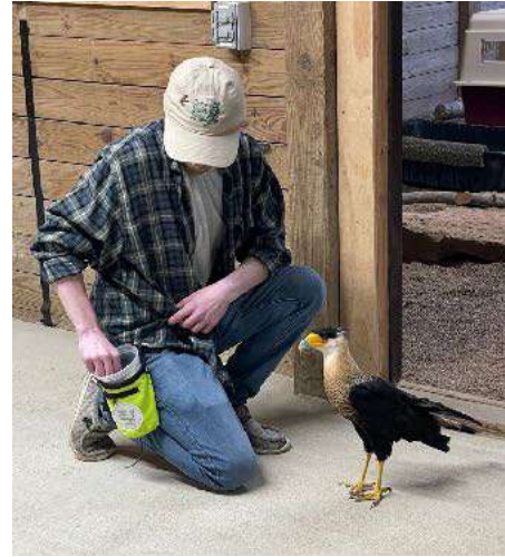
A Crested Caracara used for programs