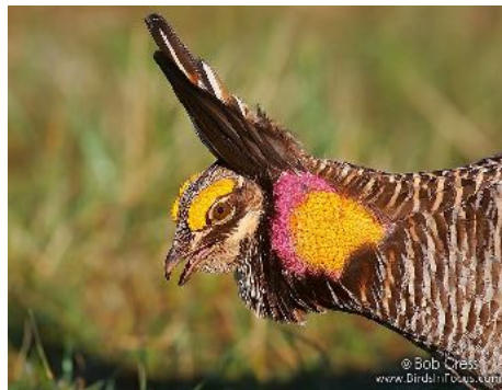
Greater Prairie Chicken