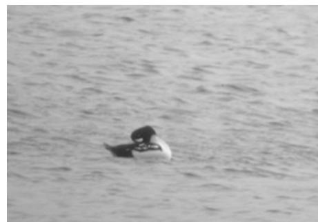
A Barrow's Goldeneye seen on the Wichita CBC