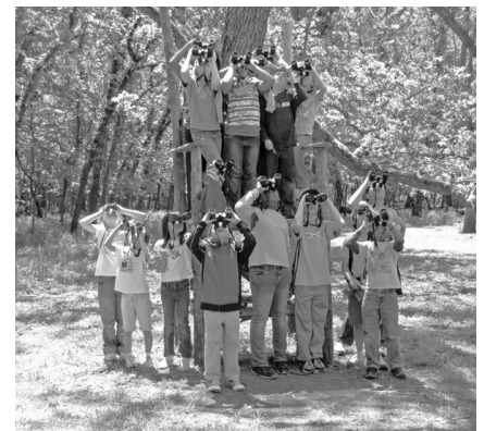
Jackson students try out their new binoculars