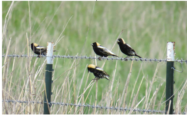
Cowley County Bobolinks

Thanks so much to all our supporters! And if you missed out it's not too late to help - remember you can donate online at www.wichitaudubon.org .