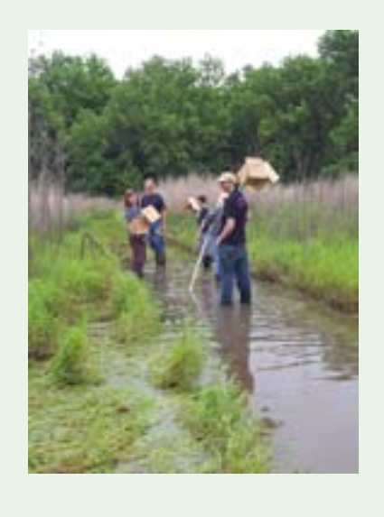
Kohl's volunteers braving the swamp-like conditions to install the boxes