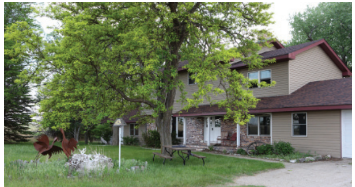
The Hutton House