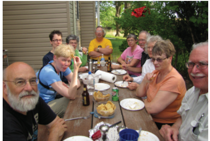
A barbecue at the Hutton House

That afternoon we went driving. We wound around on some truly obscure little sand tracks, but never got completely lost and saw lots of good birds, including Western Grebes, Trumpeter Swans, Upland Sandpipers, Yellow-headed Blackbirds and many, many Orchard Orioles. The second day we went over to Valentine. We spent the morning at Ft. Niobrara NWR where we hiked the falls trail and found Black-and-White Warbler, Yellow-breasted Chat, Yellow Warbler, Red-breasted Nuthatch and many more. We kept hearing Ovenbirds, but never did actually see one. After lunch in Valentine we went down to Valentine