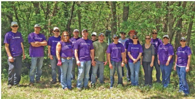
The G. E. crew volunteering at CNC

In May, twenty-seven volunteers from GE Aviation-Strother Field celebrated Earth Day by spending the afternoon working on projects at the Chaplin Nature Center. The volunteers worked on removing the old outhouse, replacing fence posts, putting wood chips on the Bluff Trail, trimming and clearing trails, and repairing the bench seats on the staircase. Thanks goes out to all the GE volunteers for supporting the Chaplin Nature Center.