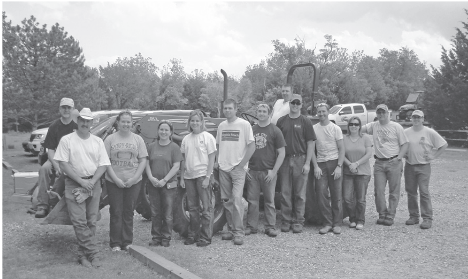
G.E. Volunteers at the second spring clean-up