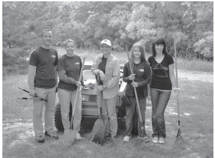
Kohl's volunteers help at Chaplin Nature Center

Through the Kohl's Cares Associates in Action program, the Chaplin Nature Center received a $1,500 grant to help benefit area youth through nature education programs. Associates from the Kohl' store in Derby volunteered at the Chaplin Nature Center this spring to help work on getting the facility ready for educational programs. As a result of the Associates commitment to helping the community, the local Derby store contributed $500.00 and Kohl's Corporate contributed an additional $1,000.