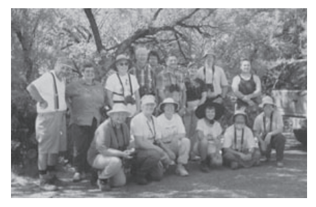
Big Bend, TX 2002