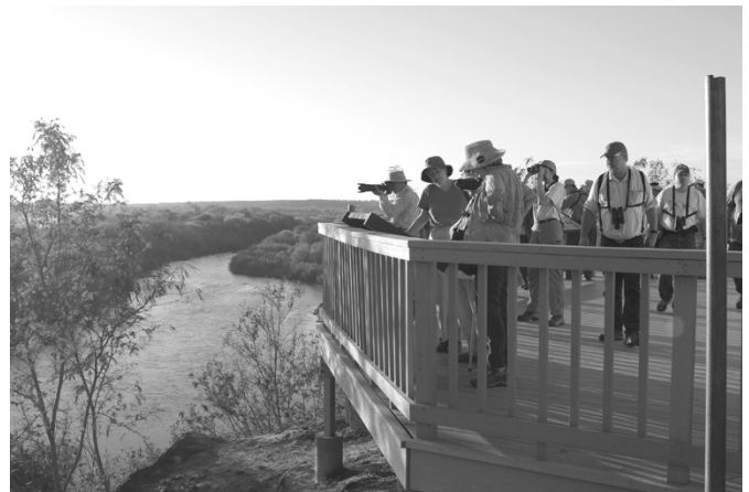
The Rio Grande viewed from the Roma Bluffs

We had a more leisurely start on Wednesday at Estero Llano Grande SP, where several "zooties" had been showing up. We were guided into a normally closed construction area (along with about 50 other birders) and saw a Tropical Parula and an exotic Black-throated Magpie-jay. The windy conditions prevented us from seeing the Rose-throated Becard hanging out there, however. They also have very cooperative