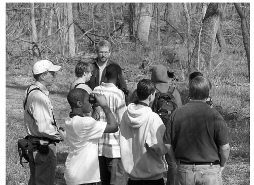
Hiking to the river