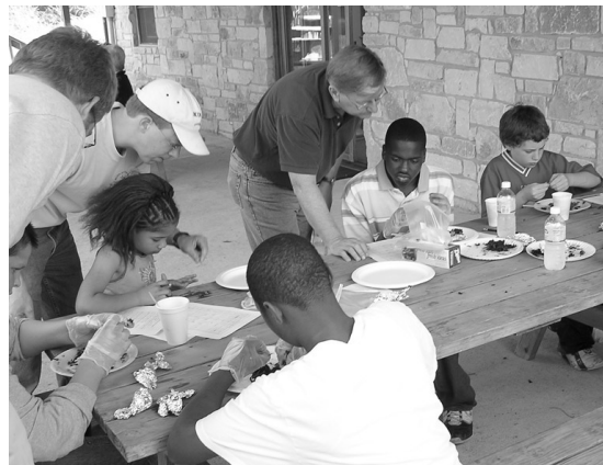
Dissecting owl pellets