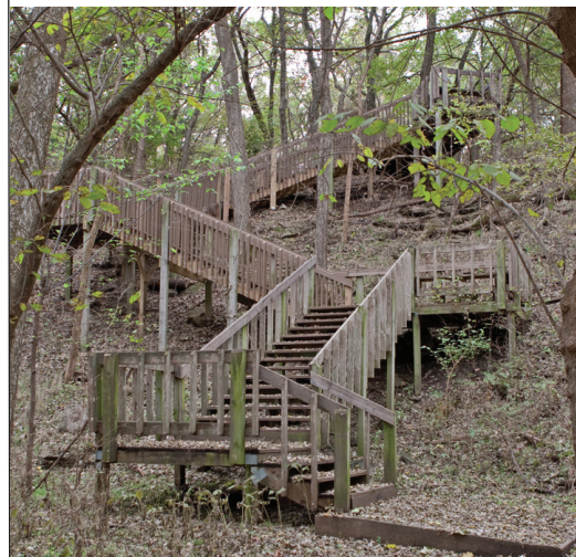
The bluff staircase at Chaplin Nature Center