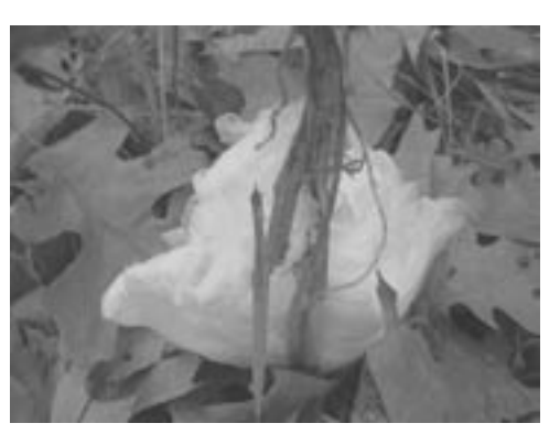
A frost flower that appeared after the early December snow.