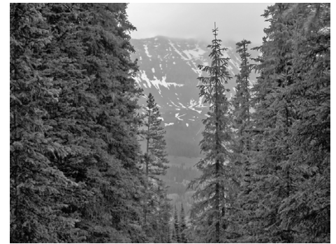
The mountains still had snow

After this daunting three-day trip, only one carload of birders ended up returning to the plateau near Columbine Pass to try for owls after