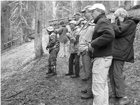
Cold and wet at 10,00 feet

In the afternoon we wandered into Utah, with some good birding at the Devil's Creek Campground located near Blanding. Good birds there included Juniper Titmouse, Bushtit, Pygmy Nuthatch, Grace's and Black-throated Gray Warblers, Cassin's Finch, and a Black-chinned Hummingbird on the nest. A brief stop at the Blanding water treatment